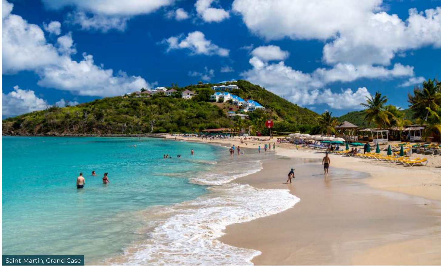
Saint-Martin, Grand Case

+33 (0)1.55.20.90.90, 9am-8pm, 7 days a week www.catlante.com