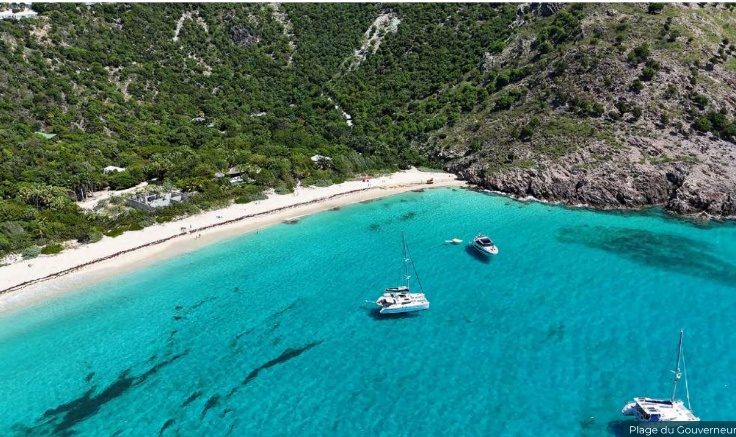
Plage du Gouverneur