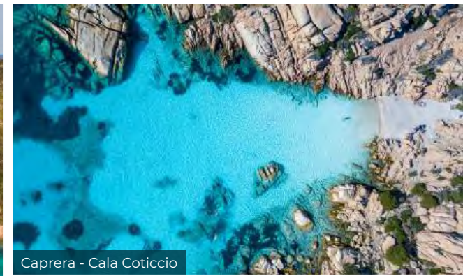
Caprera - Cala Coticcio