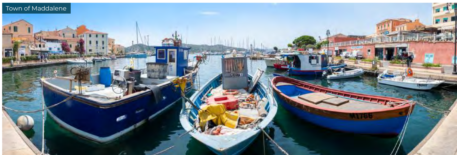
Town of Maddalene