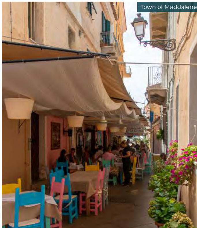
Town of Maddalene

We will anchor for the night in this paradisiacal area, surrounded by wild nature and crystalline waters, perfect for a sunset swim.