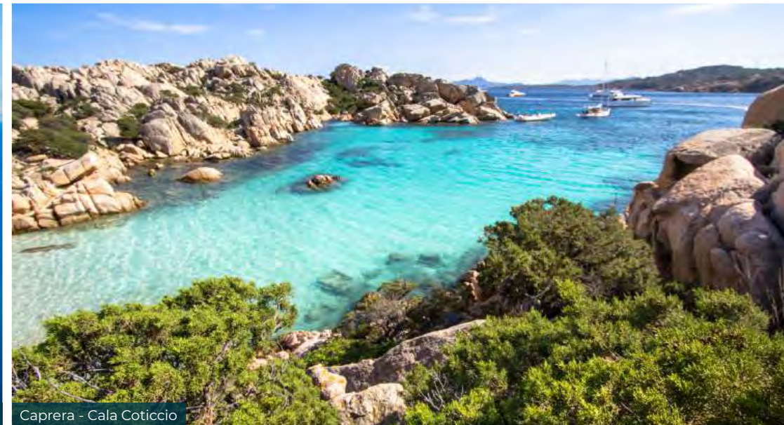
Caprera - Cala Coticcio